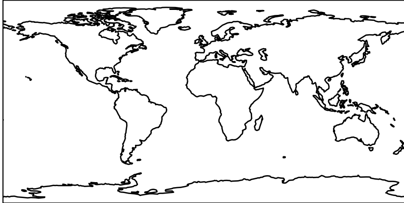
GCC_13.2.0 (Ref) 4.0x5.0