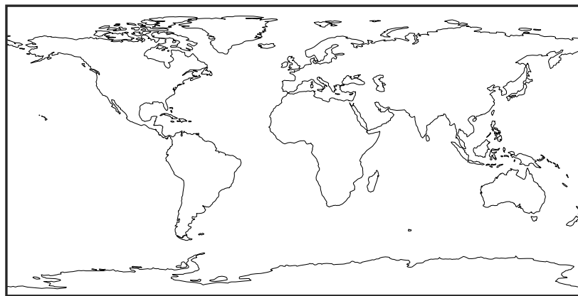
GCHP_14.2.0 (Dev) c24