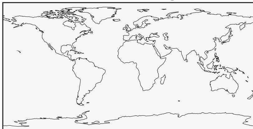
Difference (1x1.25) Dev - Ref, Restricted Range [5%,95%]