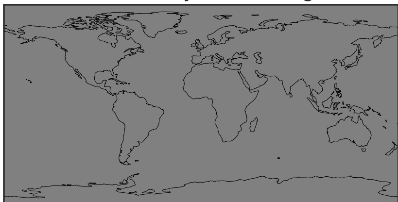
Ratio (1x1.25) Dev/Ref, Dynamic Range